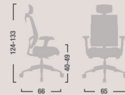
LV10 – LV20 Poltrona ergonomica con braccioli regolabili e oscillante mov. 19. Ergonomic armchair with adjustable armrests and oscillation mov. 19.