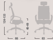
LV11 – LV21 Poltrona ergonomica con braccioli e oscillante mov. 19. Ergonomic armchair with armrests and oscillation mov. 19.