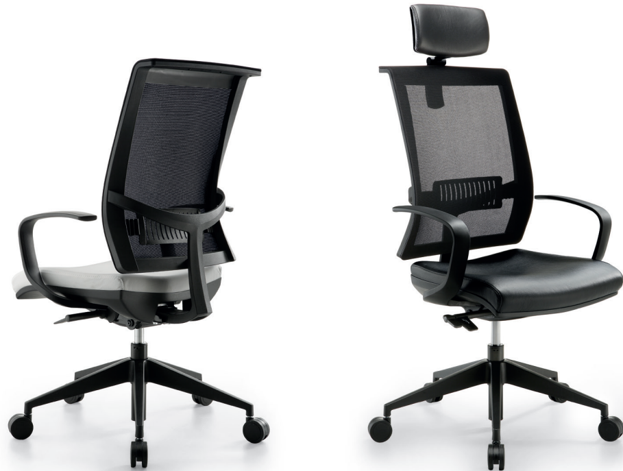
LIVING OPERATIVE CHAIR