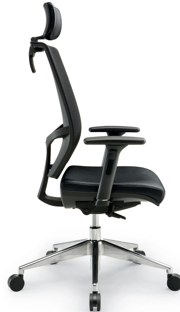
LIVING OPERATIVE CHAIR